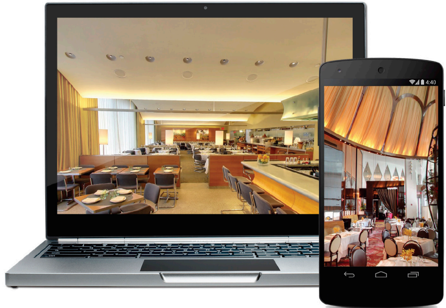
Tour business interiors with Google Maps Business View on desktop, mobile, and tablet devices