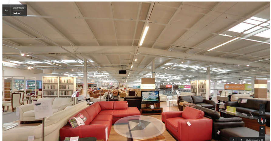
Business View in the Leekes Coventry store.